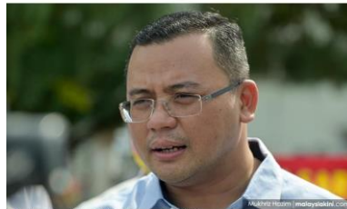
MB Selangor kuarantin sendiri, isteri dan anak positif Covid-19