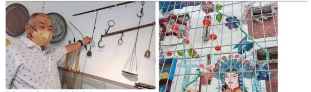
Kim Huat showing the copper scales he donated to the museum.